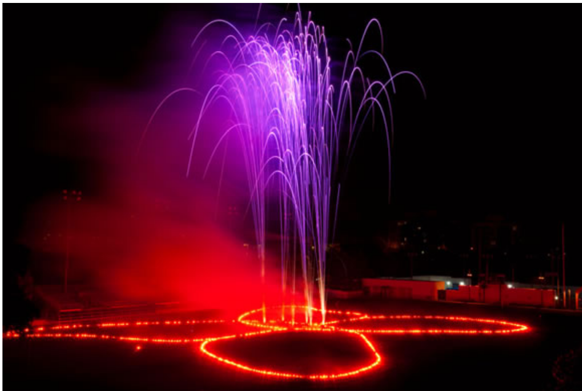
A Butterfly for Pomona , 2012 Performance at Pomona College, Claremont, CA as part of Getty Pacific Standard Time Performance Festival